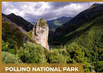
POLLINO NATIONAL PARK