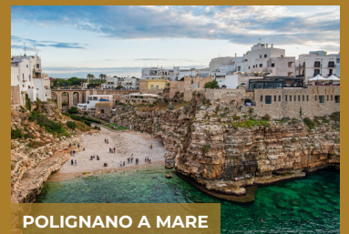
POLIGNANO A MARE