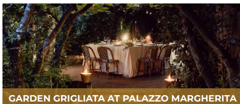
GARDEN GRIGLIATA AT PALAZZO MARGHERITA